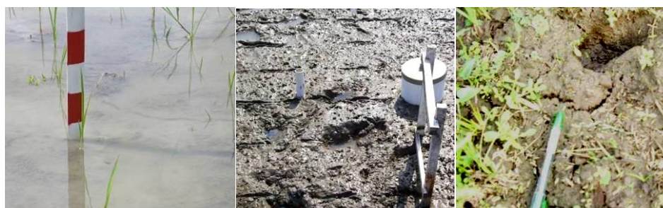
Figure 2 Condition of soil at shallow pond of 2 cm (left) saturated soil (middle) and hair cracks (right)